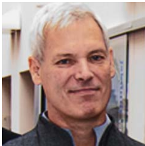
University of Lapland

"I think one key thing is simply having a broad understanding of issues, not only in a favorite science, but also what that science means socially and politically. Everything is connected, and you need to see as much of the picture as possible to see where to go."