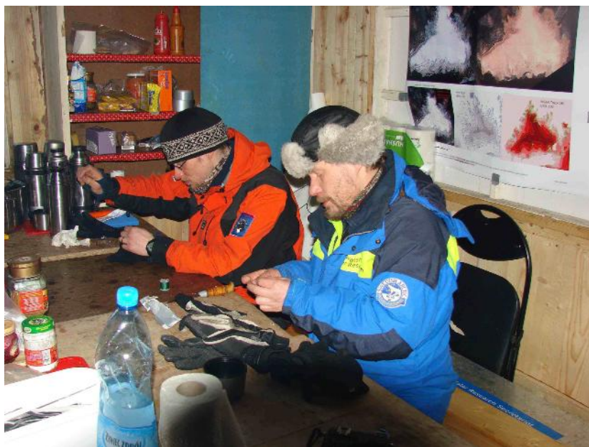
Image 7 During the course of the season other things than science also needed attention. Here the local sewing club has gathered together.