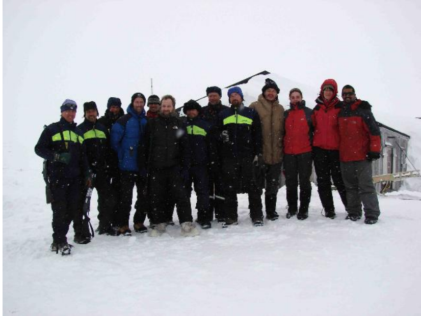
Image 8 Few days before first flights out for the later team everybody had gathered to the station.