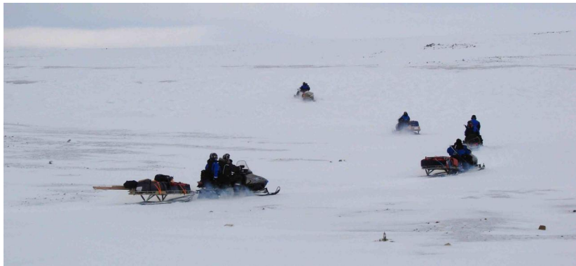
Image 1 Shuttling people and equipment up to Vestfonna ice cap from the Kinnvika station

The expedition prepared for activity and transported the drilling team to the Vestfonna icecap sometimes under difficult weather conditions. Meanwhile first snow samples for black carbon research were gathered from the area near the station. On 19th of April an attempt was made to transport PhD Gerit Rotchky and myself up to the icecap to for snow research. The attempt failed due to the large amount of new soft snow on the terrain.