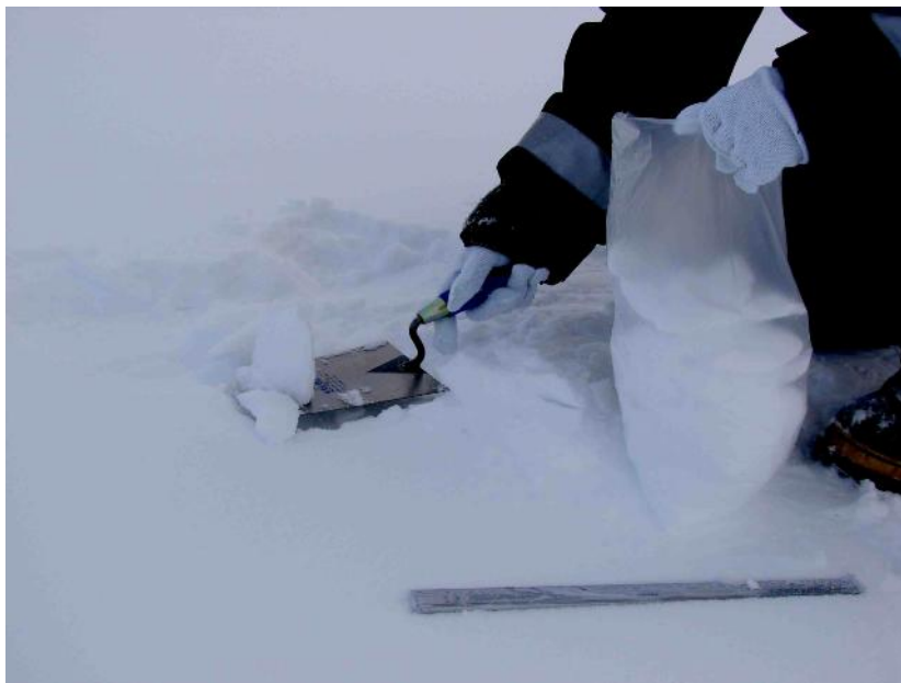
Image 2 Sampling snow for black carbon near the Kinnvika station. Black carbon samples were collected from each snowpit location.