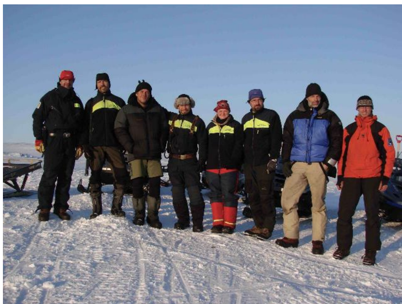
Image 6 Part of the team changed halfway through the season. This is the first part of the team, excluding the drilling team, a few days before the switch.