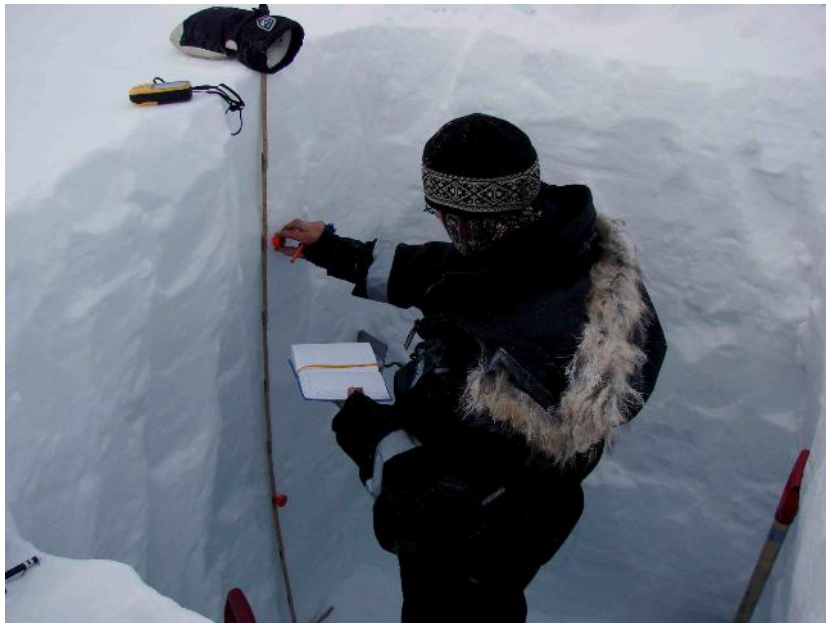
Image 4. Measuring the physical properties of the snow on Vestfonna. The site is next to the drilling camp.