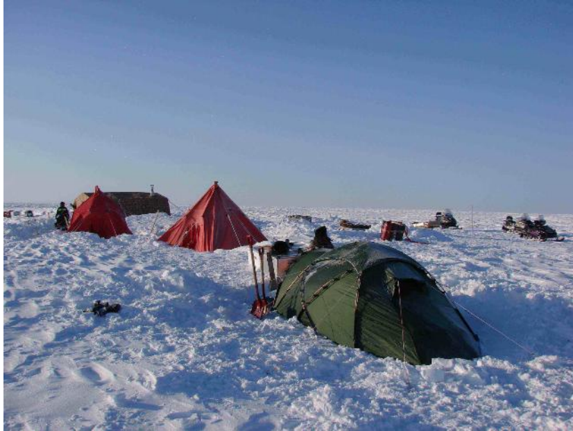
Image 3 Field camp on top of the Vestfonna icecap. Several visits were done to the drilling camp from Kinnvika.