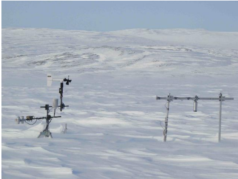
Image 5 Swedish weather station on the northwestern slope of the icecap. The station was heavily buried in snow and took a good effort to be maintained.

On 24th the snow research was started with first 2m deep snow pit at the drilling site at Vestfonna. After two days at the icecap I returned to the Kinnvika station. Few more sites for black carbon analysis were taken in the vicinity of the station. On 28th of April next trip to Vestfonna started together with Prof. Veijo Pohjola and PhD Rickard Petterson. After a long day with one snow pit excavated and PAR- sensors collected from the Swedish weather station the team returned to Kinnvika. The same team returned to Vestfonna on 30th of April. Two more snow pits were excavated on the northwestern slope of Vestfonna. This time we stayed on the Vestfonna icecap and camped at the drilling site. The next day, 1st of May, I managed to investigate one more snow pit on the southern side of Vestfonna. The weather didn't allow proceeding further down the glacier, so ice radar profiles were made on the top of the ice cap. In the evening we received new people from an exchange flight of expedition members on 30 th of April.